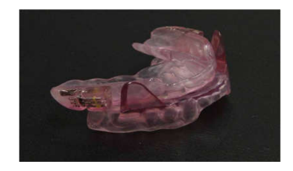
Figure 3. Mandibular advancement device

Mandibular advancement device (MAD) -This is the most widely used dental device for sleep apnea. It is similar in appearance to a sports mouth guard. The use of this functional prosthesis counteracts the condition causing OSA, via elevation of the base of the tongue, increased palatoglossus muscle tone, soft palate protrusion, pharynx expansion and standardization and stabilization of pharyngeal walls (Manhony, 2012).