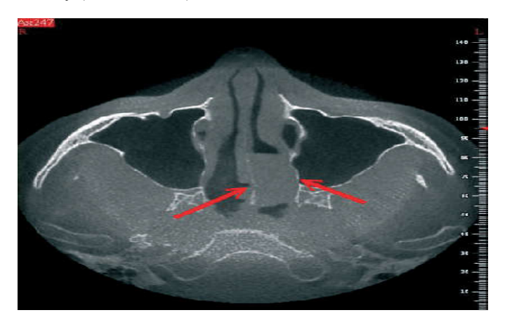
Figure 1- Left lateral septal mass (red arrows) taken from CBCT initially taken for evaluation of OSA.

CBCT allows the clinician to visualize and measure changes in airway size in 3 dimensions and configuration after both nonsurgical and surgical therapy. One of the major advantages of CBCT is that its relatively low radiation dose and wide availability make it an ideal tool to evaluate the effects of therapeutic interventions (Strauss, 2012). The most common CBCT measurements used to compare the static morphology of the upper airway between OSA patients and non-OSA patients are the minimum surface area of the oropharyngeal region and the anterior-posterior and lateral dimensions of this area. The airway of a patient with OSA is smaller and is narrowed laterally (Strauss, 2012).